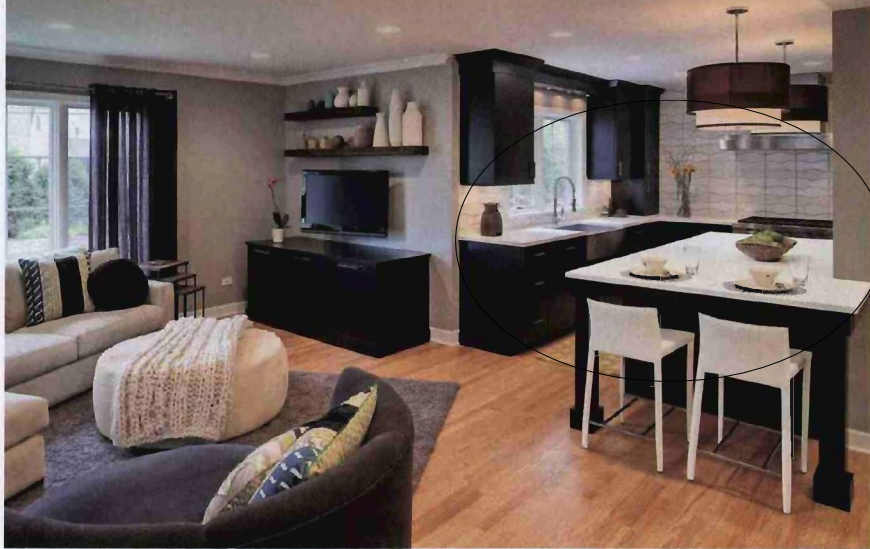
ABOVE The family room feels connected to the kitchen thanks to uninterrupted oak flooring, similar palettes, and matching cabinetry. RIGHT An undercounter microwave oven saves space and keeps a not-so-attractive appliance below eye level.

What could be done, however, about a load-bearing column, newly exposed, in the expanded room?